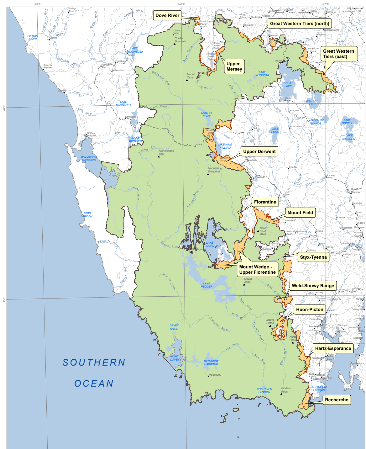
Map 1. Tasmanian Wilderness World Heritage Area Existing and Proposed Boundary